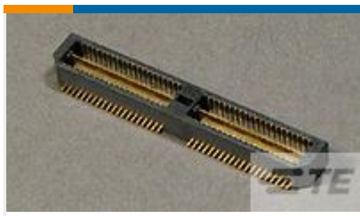
TE Part # 5-1658044-2 MSB0.80PL5ASY56DP,GP,F,VCTR