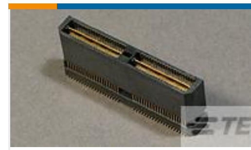
TE Part # 5-1658047-2 MSB0.80PL16ASY56DP,GP,F,VCTR