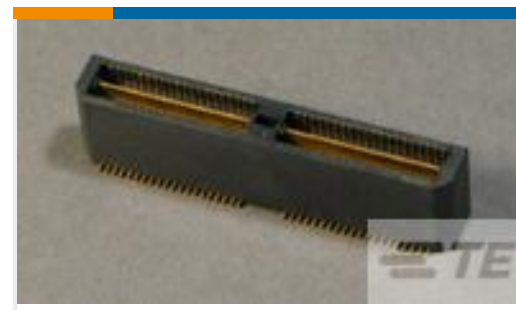
TE Part # 5-1658046-2 MSB0.80PL11ASY56DP,GP,F,VCTR