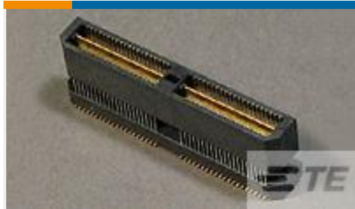
TE Part # 5-1658437-2 MSB0.80PL14ASY56DP,GP,F,VCTR